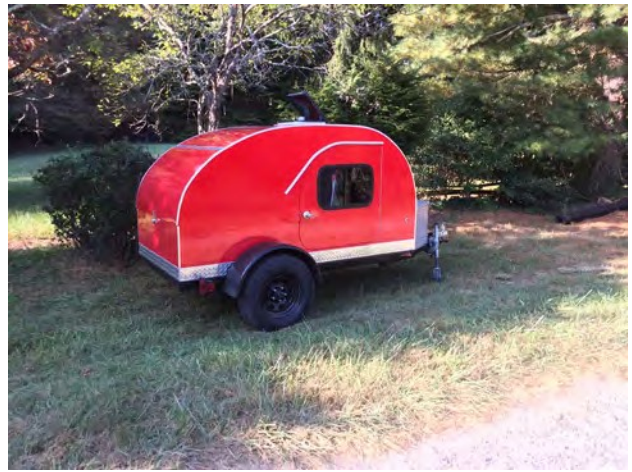
One of the stops on the 2018 Moyaone Homes' Tour was "Woodstock," the Romeo-Schwaller teardrop trailer.

All this thanks to a small, industrious critter with a flat tail.