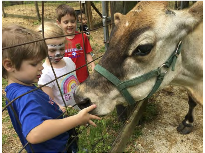
On May 5, the Alice Ferguson Foundation opened its doors to neighbors and friends for this year's Hard Bargain Farm's Spring Farm Festival. See the website for more photos ( https://www.flickr.com/photos/hardbargain/sets/72157694818750201/page1).

Davies Concert Series, a tax-exempt 501(c) (3) charitable trust, is committed to presenting classical music concerts, offering educational opportunities for young audiences, and providing a venue for new American music. Tickets are $15 for adults; $5 for 0 to 18-year-olds.