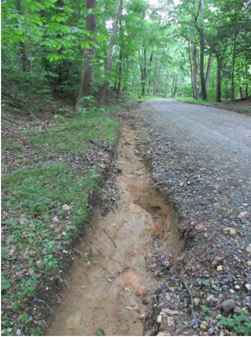
Heavy rains in the last four weeks have opened deep ditches along some Moyaone roads. This one is on Reserve Road. Road repairs are in progress.