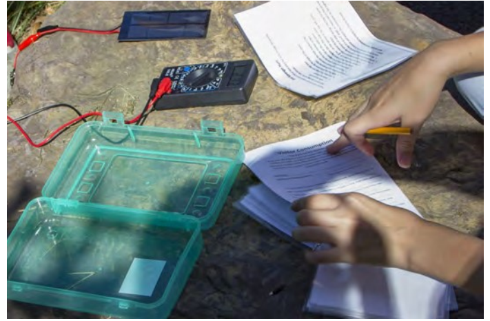
(above) Rendering of new proposed lodge for Hard Bargain Farm's environmental campus. (At right, top and bottom) Students visit the Cafritz Environmental Center and explore sustainability and renewable energy by doing hands-on experiments to measure energy produced by solar panels.