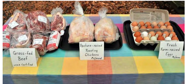
Fresh farm products can be purchased from the Hard Bargain Farm.