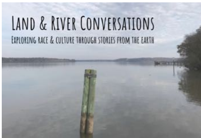
at Piscataway Park.