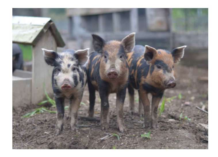
Ossabaw hogs are a heritage breed, a term used to describe historic or endangered livestock breeds.