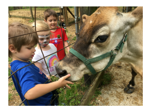
Children enjoy meeting the animals at the AFF annual Spring Farm Festival. This year's event is on Sat., May 2.