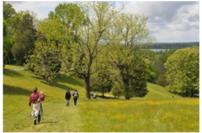
Summertime activities at the Alice Ferguson Foundation include a members-only online “Brunch at the Barn” and small group/family visits to the farm. See below for details.