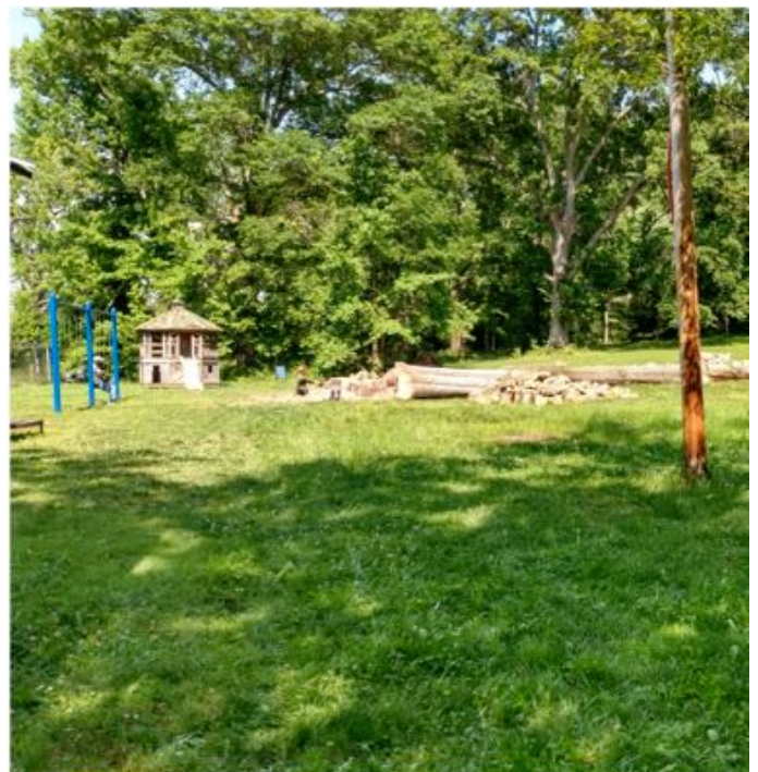
In preparation for the opening of the Moyaone pool, two large trees were felled, as they were storm-damaged, and unstable. (Top) Before removal. (Bottom) After.