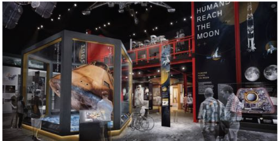
Photos: (Top) Prior to renovation, the marble facade of the National Air and Space Museum showed deterioration. (Below) A facsimile of a future gallery at the museum shows the exhibit: "Humans Reach the Moon."