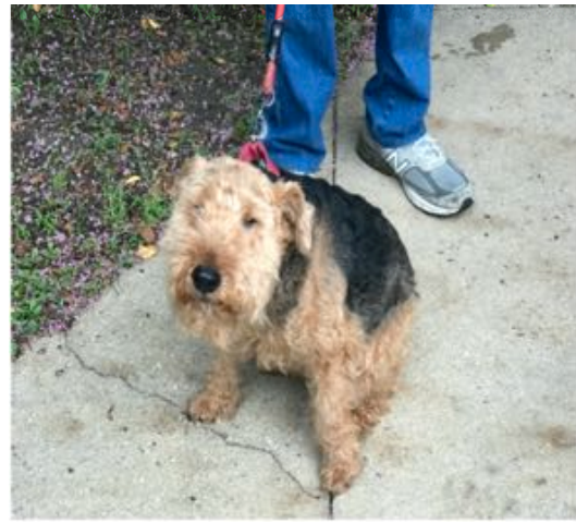
A future star on the Moyaone calendar?