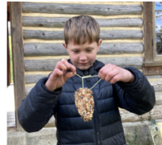
(left to right) Exploring at the Hard Bargain Farm; woodland/fairy house; Children's Garden scarecrow; birdfeeder using pine cones.