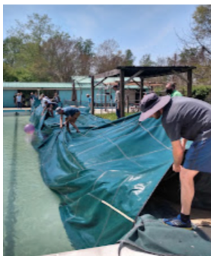
Many volunteers worked to uncover the pool at a work day in April.

6:30 pm, on Tuesday, May 17, at 2311 Bryan Point Road. Reach out to any of us, or to me (email russelhc@yahoo.com or text 240-383-9708), to reserve a spot.