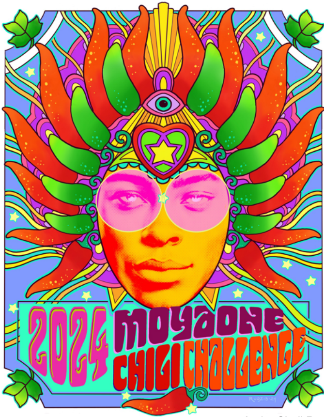
Art by Cindi Rudzis